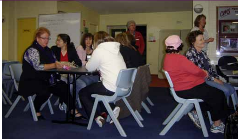
Enjoying fellowship at Mt Tamborine