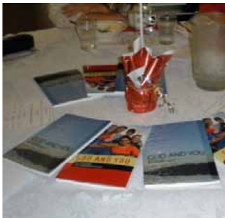
New Testaments were distributed