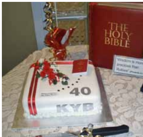
40th Anniversary cake

Wisdom and rubies were the theme of the celebrations held by two Committees