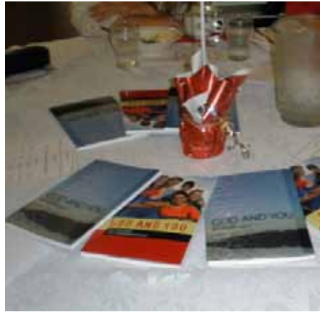
New Testaments were distributed