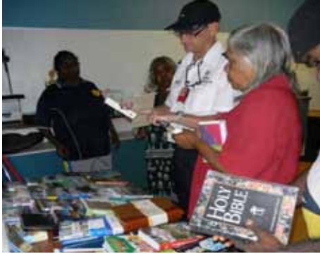
Looma: Browsing the bookstall

Safaris to various remote areas of our country are vitally important to our ministry. The teams have amazing experiences as they minister to those who are thirsting for fellowship and share around God's word.