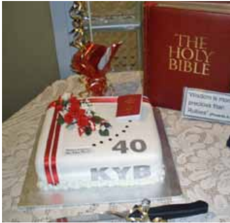
40th Anniversary cake

Wisdom and rubies were the theme of the celebrations held by two Committees