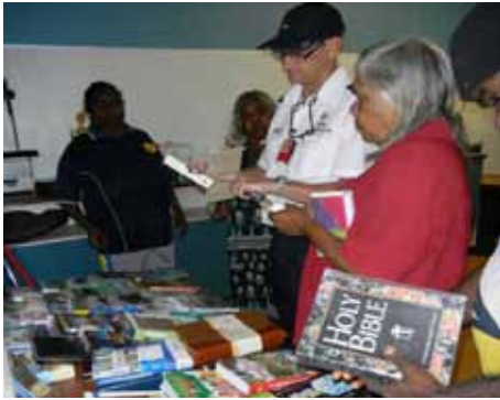
Looma: Browsing the bookstall

Safaris to various remote areas of our country are vitally important to our ministry. The teams have amazing experiences as they minister to those who are thirsting for fellowship and share around God's word.